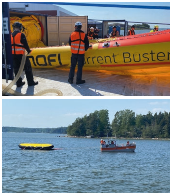
\mathsf{EMSA}\mathsf{'s} Oil Spill Response Equipment is made available to maritime authorities for rapid deployment in case of a pollution event.

As part of our first Multipurpose Maritime Operation (MMO) in the Baltic Sea region, a three-day hands-on training was delivered on the use of EMSA's Oil Spill Response Equipment available from the local stockpile in Tolkkinen, Finland. Eight officials with responsibilities in oil spill response from Belgium, Denmark, Finland, Latvia, the Netherlands and Finland, experienced first-hand the use of the equipment - its preparation, deployment and operation. On display were the various capabilities of the Current Buster 6, EMSA's work boat, an oil storage barge, a ro-trawl system, and a fence boom. These capabilities are available for rapid deployment around-the-clock in case of a pollution event anywhere in European waters and shared sea basins.