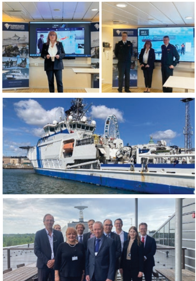
The MMO launch was also the occasion to meet with the Finnish Transport and Communications Agency, Traficom, as well as with the Finnish Meterological Institute for exchanges on possible areas of collaboration.

EMSA, in collaboration with maritime authorities from Finland, Latvia, and Estonia, has initiated a Multipurpose Maritime Operation in the Central and Eastern Baltic Sea. The operation, launched at the request of Finnish authorities, aims to enhance maritime safety, search and rescue efforts, border control, fisheries control, maritime surveillance, and environmental protection and response across the Estonian, Finnish, and Latvian maritime jurisdiction areas. Running until 31 August, the operation involves EMSA, EFCA and Frontex, providing comprehensive support to coast guard functions in the three participating Member States. The MMO was formally launched on 5 June from on board the OPV Turva in Helsinki where EMSA Executive Director Ms Markovčić Kostelac met alongside Chief of the Finnish Border Guard, Lieutenant General Pasi Kostamovaara, and the Deputy Chief, Real Admiral Markku Hassinen. The services and assets deployed as part of this MMO are unique, enhancing situational awarenss over four domains: sea surface (with the integrated maritime picture); underwater surveillance (ROV); aerial oversight (RPAS) and Earth Observation (CleanSeaNet and Copernicus Maritime Surveillance)